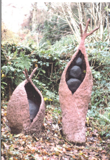
'Pods' made from welded steel and cement and straw. Can be seen at Broomhill Art Hotel and Sculpture Garden, north of Barnstaple

Pictured below: some examples of Carol's work