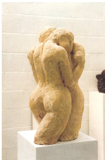
'Embrace' made from plaster. Now in the private ownership of Dave Clark of the Dave Clark Five.